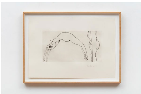
Louise Bourgeois Arched Figure , 1993 drypoint 15 5/8 x 22 inches (39.5 x 56 cm) uns proof (#0/0)