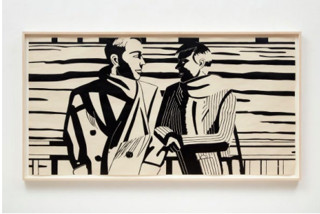
Alex Katz 3 PM, 1988 woodcut 36 3/4 x 72 inches (93.4 x 182.9 cm) Roman Numeral X/X (#10/10)