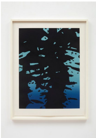
Alex Katz Reflection II, 2011 3 color etching 41 x 31 inches (104.14 x 78.74 cm)