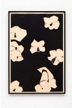
Alex Katz Impatiens, 2001 signed and numbered linocut 54 x 36 1/4 inches (137.2 x 92.1 cm)