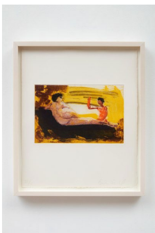
Eric Fischl Puppet-Tears , 1985 aquatint, sugar-lift, drypoint, and scraping 15 x 12 1/2 inches (38.1 x 31.75 cm) Roman Numeral VI of X (#6/10)