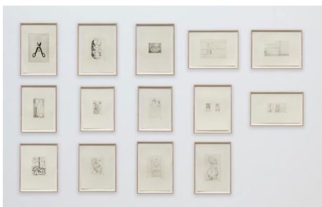
Louise Bourgeois Autobiographical Series , 1994 drypoint and aquatint s proof (#0/0)