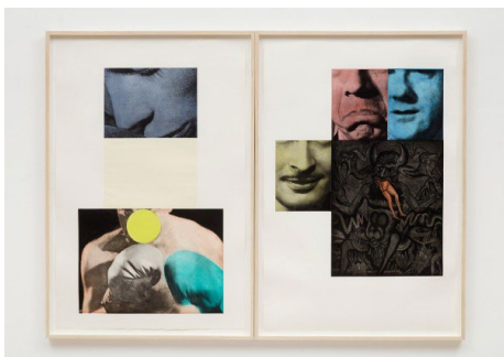
John Baldessari Heaven and Hell , 1988 aquatint, scraping, roulette, and photo-etching 47 1/4 x 31 1/2 inches (120 x 80 cm) Unsigned Proof 1 of 7 (#0/7)